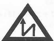
A) Left Reverse bend