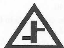
C) Staggered intersection